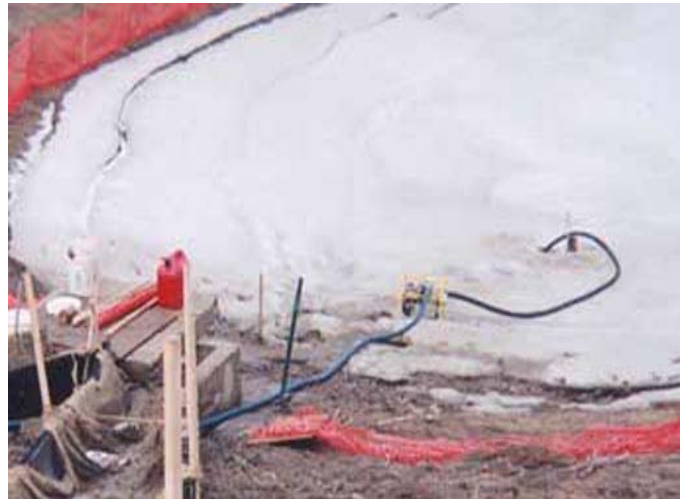
Even in frozen conditions, this system could be run. Reaction times are prolonged with colder temperatures, however the Floc Logs® still work.

A hole was cut in the ice to allow the pump-feed to draw water out of the pond. The water was pumped up the hill before reaching the pair of split pipe treatment systems. The water was allowed to flow back down the split pipe before being discharged into the concrete storm box where the initial turbidity problem had come from.