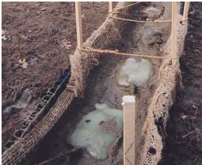
The Floc Logs® were secured along the treatment pipe using the stakes that held the split pipe in place.

The entire length of split pipe was coated with three layers of coir-jute erosion control matting. The coir-jute matting is a very loose weave material that can easily be draped over the wooden stakes fitted into the split pipe slots to hold it in place. Since the matting acts as a filter and surface area, allowing the flocculated material to adhere to it, care was taken to assure that the matting was hanging in the water flow.