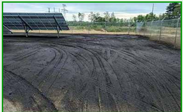
GeoEarth applied 4500 lb./acre