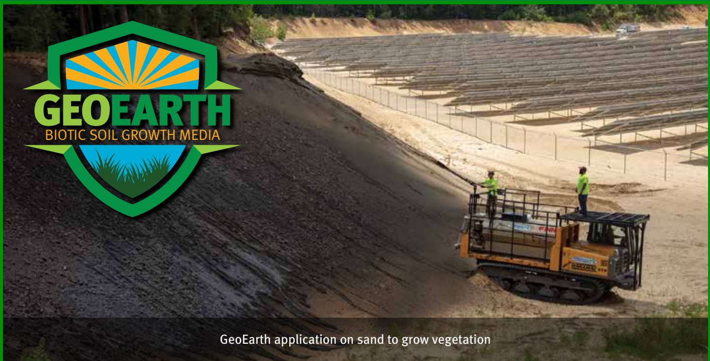
GeoEarth application on sand to grow vegetation