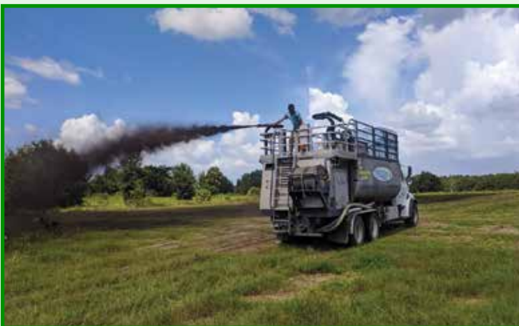
Application through hydroseeder