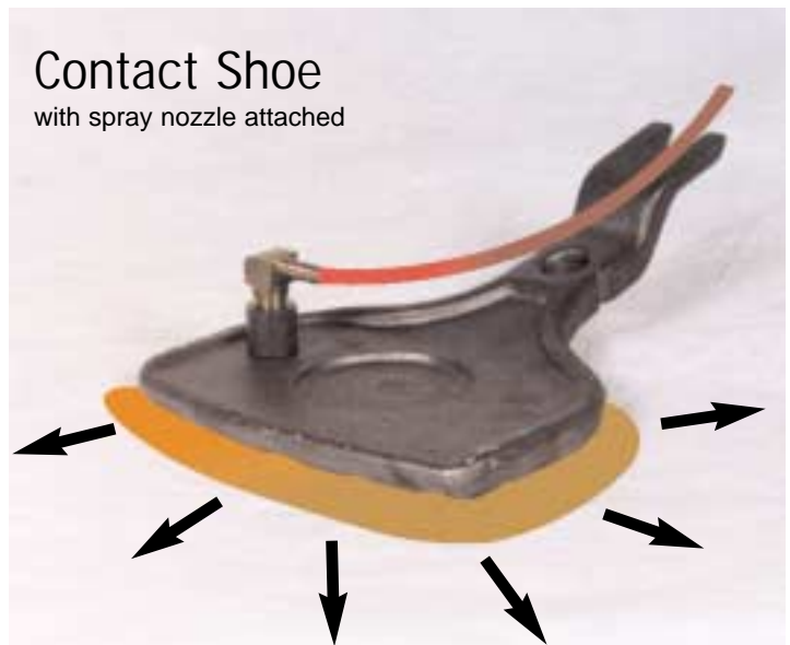
Third Rail Anti-Icer is applied through the hose barb to the rail surface below

If you want to be on the "Cutting Edge", find out more about ICE-SLICER® . Call one of our service representatives at 1-800-321-0699 and let's get something going for you!