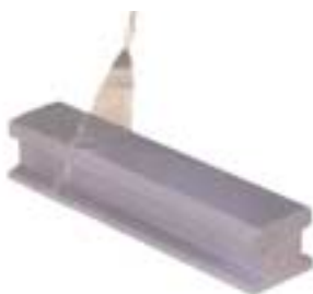
Third Rail Anti-Icer™ is sprayed directly onto the rail.

Third Rail Anti-Icer utilizes a NASA “Smart Fluid” technology we call Zero Gravity™ , co-developed by NASA/Ames Research Center and Midwest Industrial Supply, Inc. (licensee of U.S. patent 5,772,912). When a small amount of this non-corrosive, biodegradable substance is sprayed