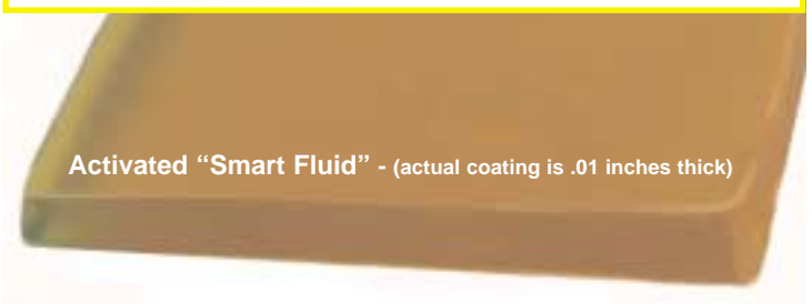
Activated “Smart Fluid” - (actual coating is .01 inches thick)

extraordinary product retains its longlasting anti-icing properties which are re-activated by freezing rain, sleet or snow. It absolutely prevents ice from forming on the third rail! Zero Gravity™ is one of the many reasons we have been the leader in anti-icing... since 1975.