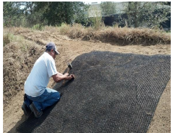
Enkamat R-45 Installation