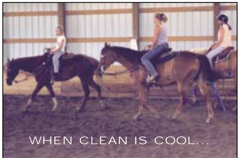
Look at the difference Arena Rx® makes!! Would you expose your horse or yourself to a dusty environment if you didn't have to?