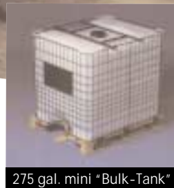
275 gal. mini "Bulk-Tank"