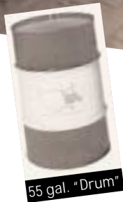
55 gal. "Drum"