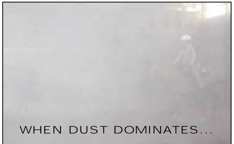
The most obvious demonstration of the effectiveness of Arena Rx® ...is to SEE the difference. In the above photo, notice the untreated arena where "Dust Dominates". Imagine what this dust does to your horse's respiratory system. What about the rider?

Arena Rx® is made from a patented process and is a safe, colorless, odorless, biodegradable, highly refined, synthetic, organic fluid, proven to be non-toxic to humans, animals, marine life and plants. Arena Rx® can be used both indoors and outdoors and does not freeze in cold weather climates. Your arena is able to be used immediately after application.