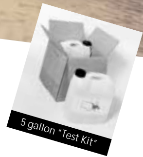
5 gallon "Test Kit"

YOUR DUST CONTROL & APPLICATION CONSULTANT: